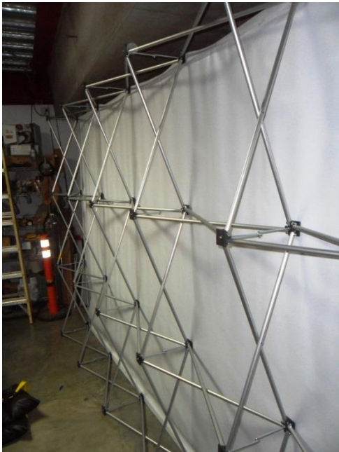
Inside the garage looking at backside of banner, this popup frame with Velcro installed in minutes.

Banners are available from many suppliers and, for the most part, come in two basic styles; those which are designed for a specific frame to hold them up and the rest. If a prefabricated frame and banner is to be used, the overall size of our display area should be kept in mind. The height should be as close to eight feet as possible, and the width should not exceed sixteen feet. The width is not as critical as the height for a nice looking result, since the garage door can swing closed to accommodate a narrower than 16 foot banner.