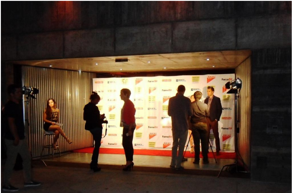
With this prefab banner and popup frame, note the gap at the top and the use of a red carpet for the VIP's to stand on. Flood lights are also a good idea to include.

Traditional banner installation is done with pockets being stitched into the top and bottom of the banner. The banner is then supported by inserting a pipe into the pocket and hanging the pipe up with a support assembly. At 800MAIN, the garage doors have been modified to support the banner pipe,